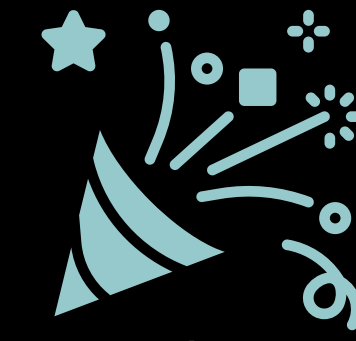
Back to School Bash